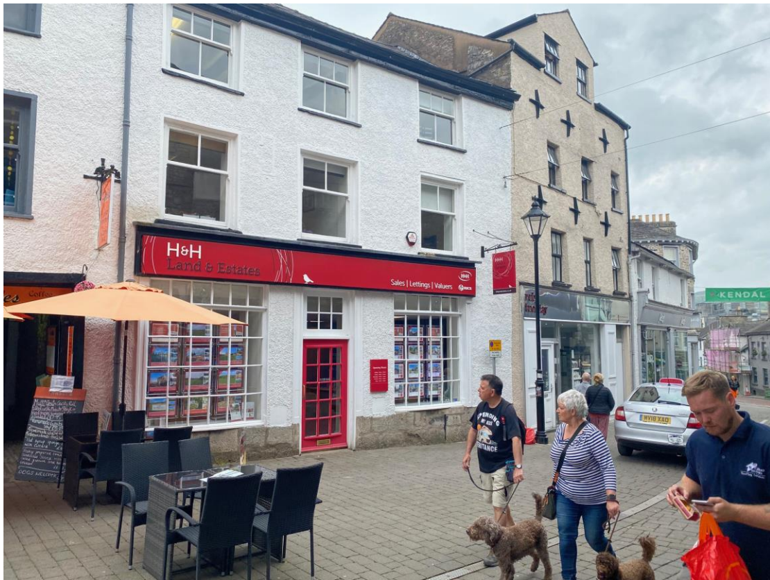
Attractive double-fronted shop opposite 'Spinning Jennies'

Ground Floor, 36 Finkle Street Kendal Cumbria LA9 4AB