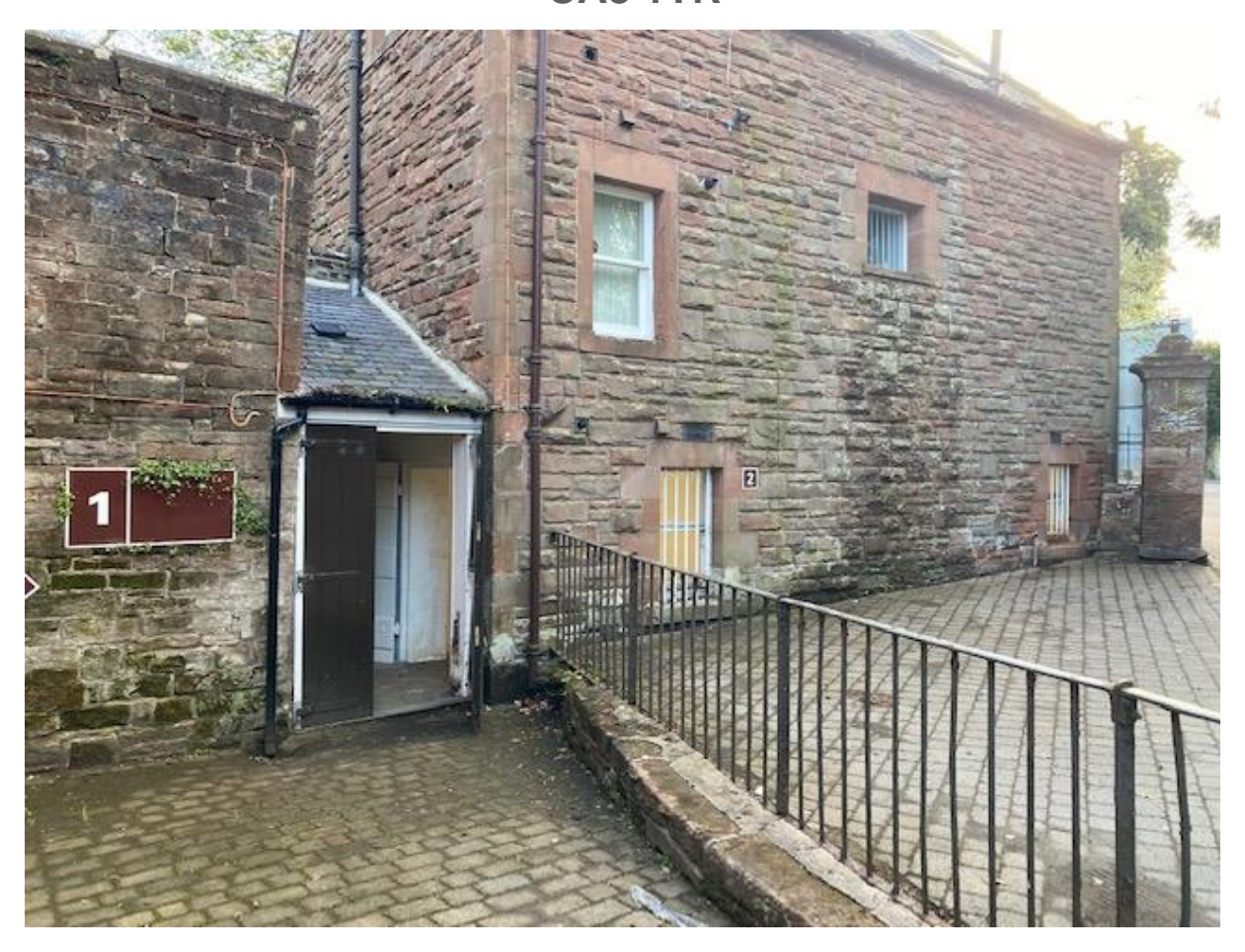
Ground floor unit suitable for a range of uses including workshop, studio and storage

Unit 1, The Old Brewery Craw Hall Brampton Cumbria CA8 1TR