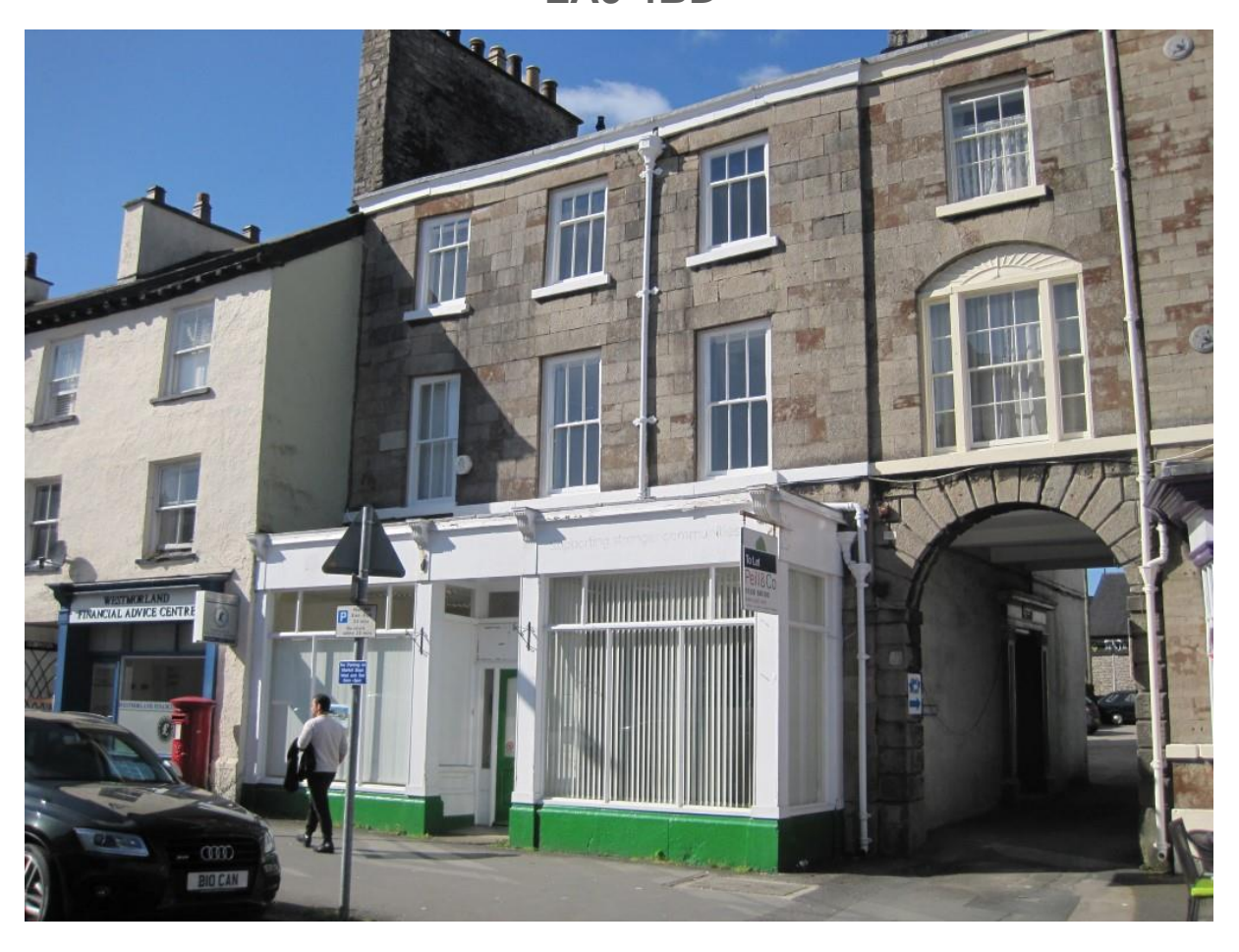
Impressive listed building suitable for a range of uses

Kendal is an attractive market town situated in south Cumbria with a resident population of approximately 25,000 but which draws on a much wider catchment incorporating surrounding towns and villages. Kendal is the administrative centre for South Lakeland and is situated approximately 8 miles from access to the M6 motorway at junction 36, 8 miles from Windermere, 22 miles north of Lancaster, 26 miles south of Penrith and 52 miles south of Carlisle. The town has the benefit of a mainline railway station at Oxenholme on the London to Glasgow/Edinburgh west coast mainline. In addition, there is a station at Kendal (a short distance from the subject property) which links to the west coast mainline and Windermere.