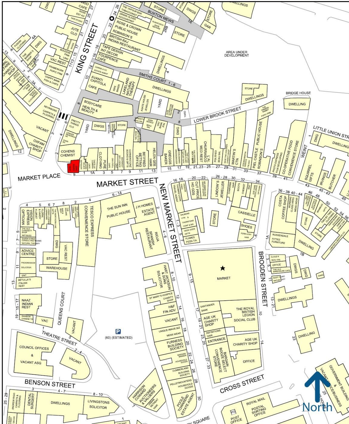
Plan for identification purposes only

Peill & Co Ltd on their behalf and for the sellers or lessors of this property whose agents they are give notice that: (i) The particulars are set out as a general outline only for guidance of any intending purchasers or lessees and do not constitute, nor constitute part of an offer or contract. (ii) All descriptions, dimensions, references to condition and necessary permissions for use and occupation, and other details are given in good faith and are believed to be correct, but any intending purchasers or tenants should not rely on them as statements or representations of fact, but must satisfy themselves by inspection or otherwise as to the correctness of each of them. (iii) No person employed by Peill & Co Ltd has any authority to make or give any representation or warranty whatever in relation to this property. Unless otherwise stated, all prices and rents are quoted exclusive of VAT. All details, plans, maps and photographs are for identification only and are believed to be correct at the time of printing. Shop occupiers are subject to change.